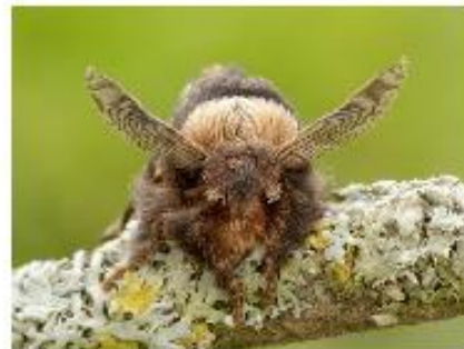
Image from Butterfly Conservation. December Moth ( Poecilocampa populifoliella ) taken by Iain H Leach. Click the photo for the Winter Moth blog.

As we move into winter, there are still a few moths to be seen, such as the December Moth, Winter Moth, and Early Thorn. Some butterflies, like Peacocks and Small Tortoiseshell overwinter as adults in dark, cool places but can be seen on warmer days throughout the winter. You can help all of these and other winter pollinators by having wintering flowers in your garden. Check out the Butterfly Conservation's blog post on winter moths for more information. Click on the December moth photo to go to the blog.