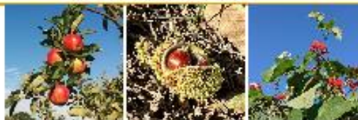
Apples, Sweet Chestnut, and Runner Beans all need pollinators

Most plants and animals, including human beings, could not survive without pollinators. Many plants and crops rely on bees, wasps, flies, beetles, butterflies, and moths to pollinate them so that they can fruit and set seed. More than twenty-five bee and hoverfly species visit apple blossom in Kent's orchards.