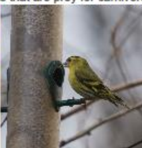
Seeds feed birds