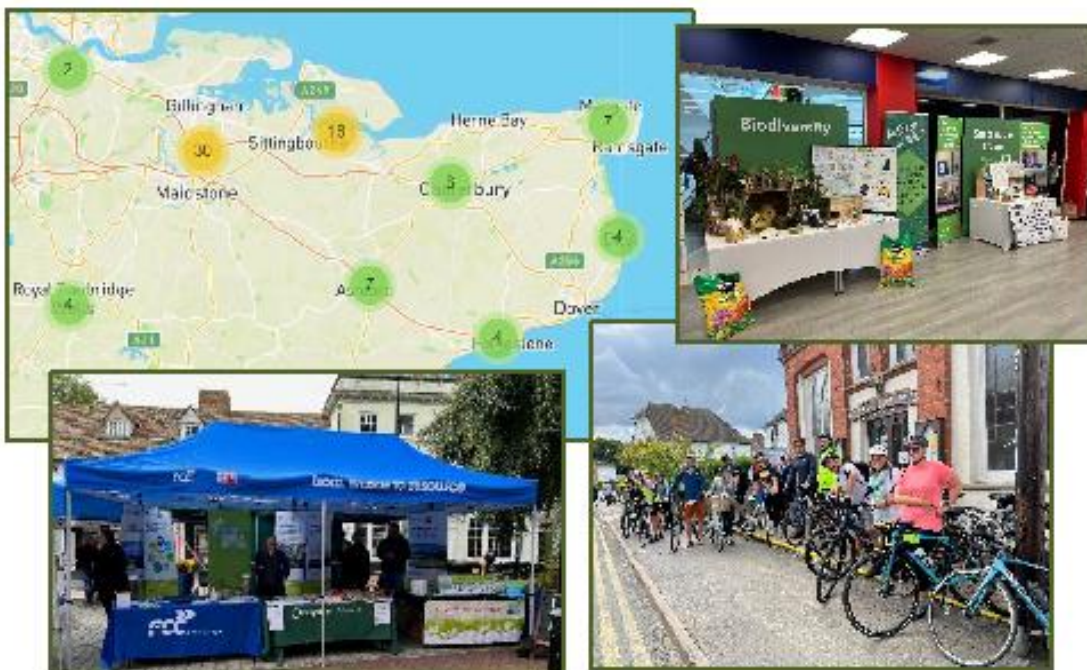
Activities and engagement across Kent during Great Big Green Week

Although the promotion of events was muted due to news of the late Queen Elizabeth, it was excellent to see 82 activities highlighted on our map of green action and have 2,000 visitors to our Let's Talk Kent pages to look up events, share their top tips and take a 'green pulse check' survey.