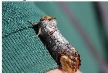
The amazing camouflage of Buff-tip moths make them look like a broken silver birch twig