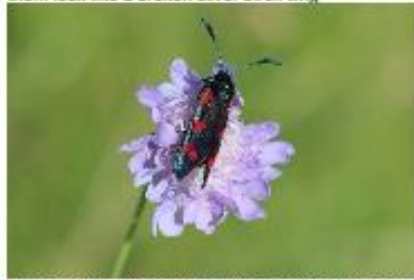
Many moths, such as this Six-spot Burnet, fly during the day