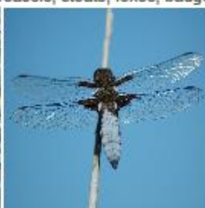
Pollinators feed other insects, such as dragonflies