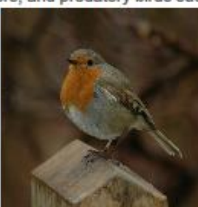
Pollinator adults and larvae feed birds and their chicks