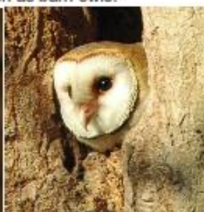
Small mammals that eat pollinators feed owls