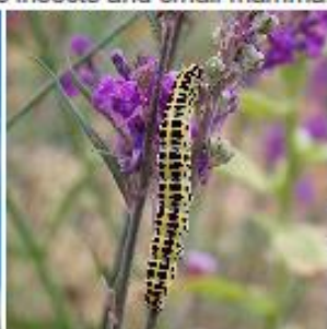
Leaves and roots feed larvae