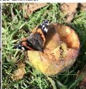
Fruits feed insects, birds, mammals and humans