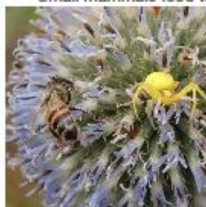
Pollinators feed other invertebrates, such as spiders