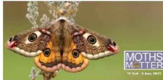
Image from Butterfly Conservation. Emperor Moth ( Saturnia pavonia ) taken by Iain H Leach. Click the photo for webpage.

From 17 October to 6 November, Butterfly Conservation are highlighting the importance and beauty of moths on their social media and website (link in Emperor moth photo). The campaign, called Moths Matter, is dedicated to educating the public on the crucial role that moths play in the ecosystem. Butterfly Conservation have made lots of resources and information available on moths. From a downloadable guide to ways to start mothing in your own garden, there is lots to find out about moths! We've even put together a list of interesting moth facts below, to give you a feel about how amazing moths are!