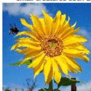
Nectar and pollen feed pollinators