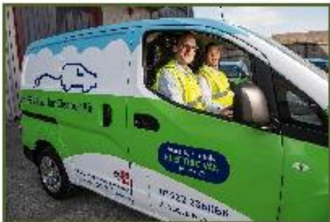
Kent REVS electric van in action

The Kent REVS electric van trial scheme is now entering its final few months of the highly successful programme. The 'try before you buy' scheme has enabled over 280 local businesses to experience the benefits of an electric van, with around 59% of businesses seeking to purchase an electric van in the near future.