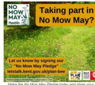
Make the No Mow May Pledge today and show your support for Kent's wildflowers and pollinators

As well as our pledge site, this month on our Facebook page we will be bringing you tips for improving your lawn for wildflowers, along with what Kent County Council are doing for No Mow May (read the article on the next page for a sneak peek into KCC's No Mow May Sites). And at the end of May, don't forget to take part in Plantlife's Every Flower Counts survey to see which flowers are growing in your lawn!