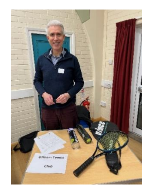
Offham Tennis Club