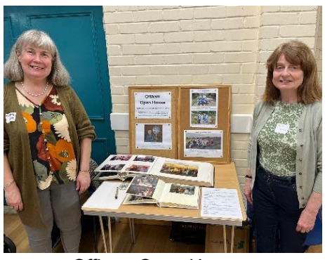
Offham Open House