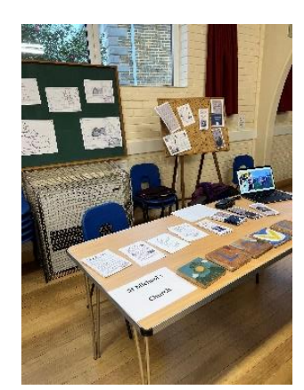
St Michaels Church