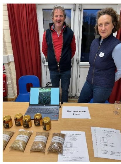
Orchard Place Farm