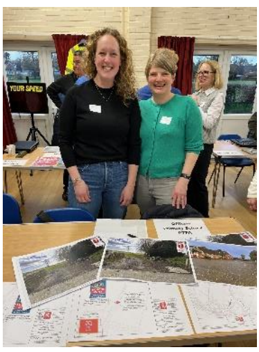
Offham Primary School PTFA