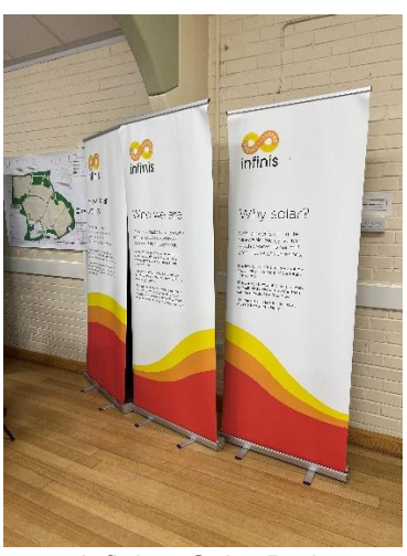
Infinis – Solar Park