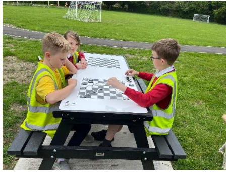
Concrete Chess Boards