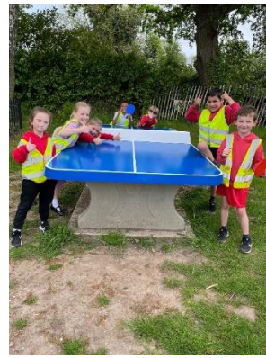
Concrete Table Tennis Table